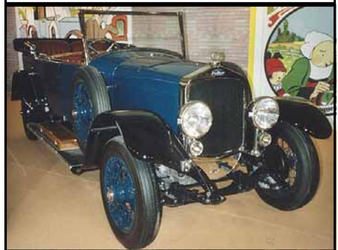
Below and Bottom: 1923 & 1925 Excelsior Adex Type C 30/80 roadsters