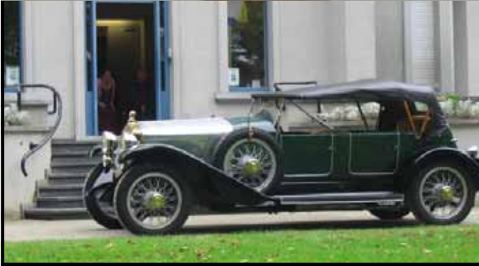
Top: 1925 Excelsior Adex-C 2-seater Above: Excelsior Adex-C Albert I Roadster

The Farman brothers, Henry, Maurice and Dick, were of English parentage but born in France. They began as racing cyclists, then graduated to cars in the early days of the 20 th century. In 1905 they became interested in the new science of aeronautics and built some of the first successful biplanes. They are today perhaps best known for their production of training and reconnaissance aircraft for the French army in WWI.