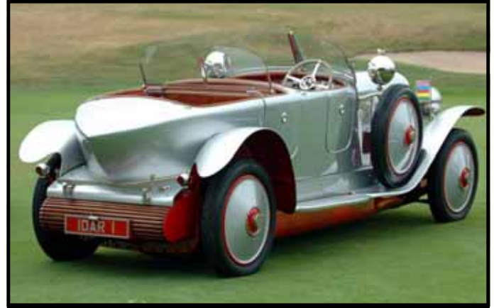
Above: 1921 Farman A6B Super Sport Torpedo Below: 1928 Farman NF Sedan Bottom: Farman A6B Coupe Chaffeur

All 1925-31 model Farman are CCCA Classics but none are registered in the 2014 Handbook.