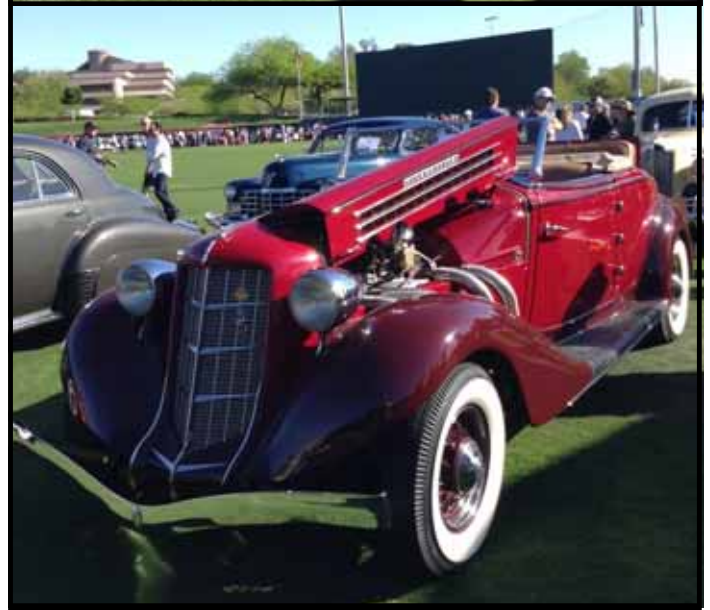
Top: Prez Ed Winkler enjoying sun and cars at the kickoff of April's Copperstate 1000 rally, where the Region had a car display.